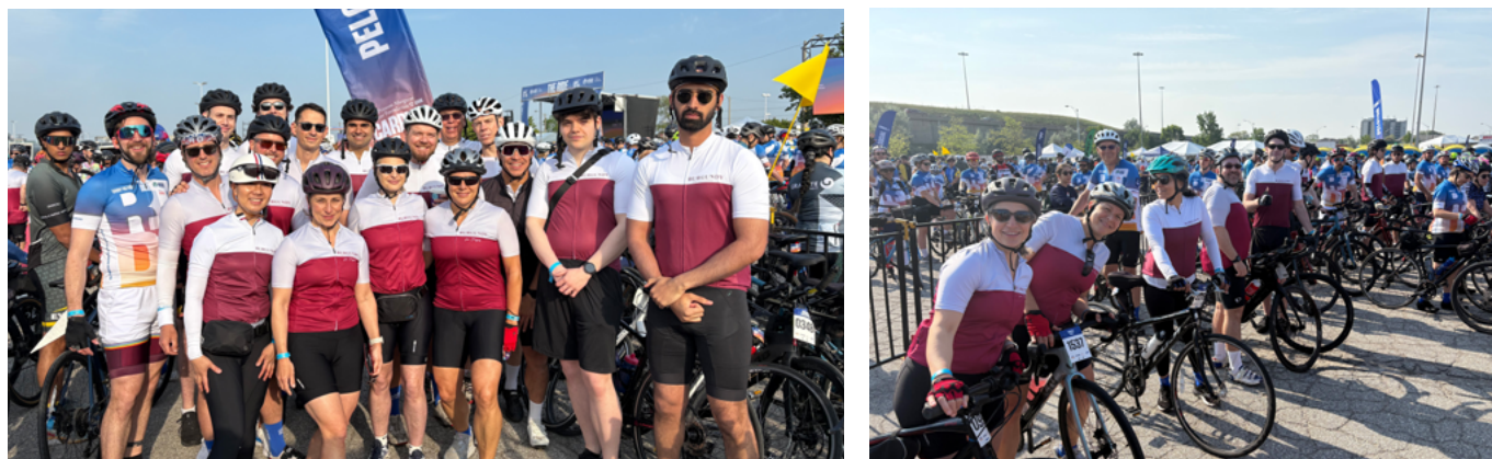
The Burgundy Team at the Ride to Conquer Cancer 2025