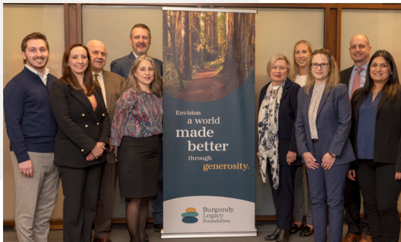
Burgundy Legacy Foundation directors alongside members of the MPNL Advisory Committee

Established in 2024, the award supports education and the development of future philanthropic leaders. It reflects the Foundation's interest in helping strengthen the charitable sector by supporting students preparing for leadership roles in philanthropy and non-profit organizations.